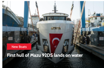
First hull of Mazu 92DS lands on water