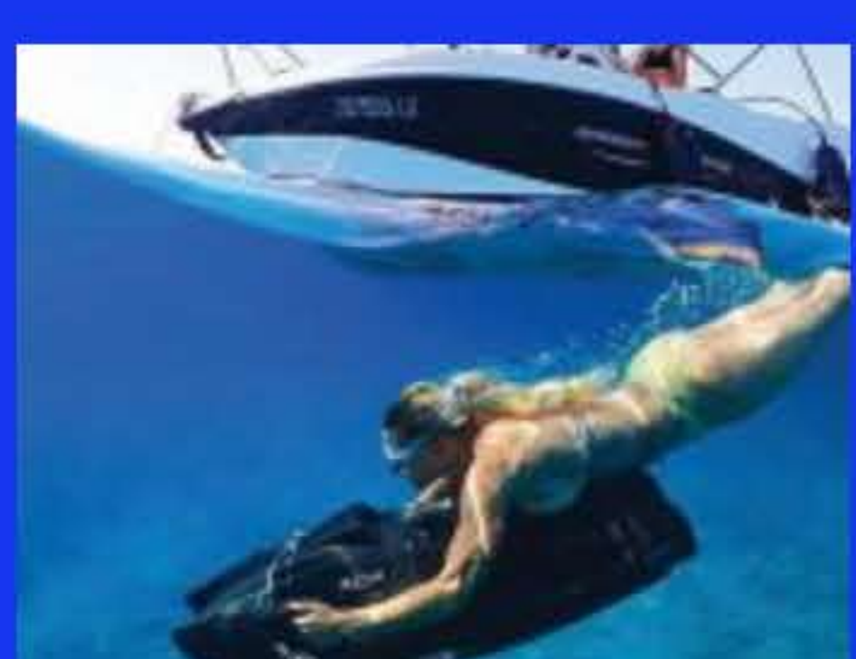
iAQUA SEADART – ADVENTURE AWAITS