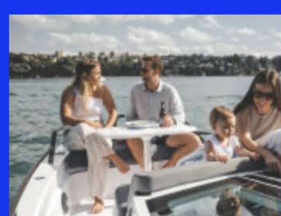
Axopar 37X Sun Top: Awakening of the Adventure Boat