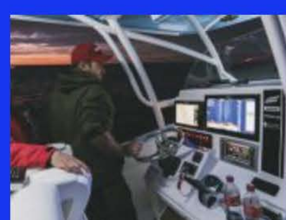
SIMRAD® MARINE ELECTRONICS – PREPARING FOR NIGHT PASSAGES